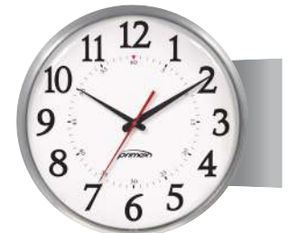
Easy-to-assemble bracket kit lets you create a dual-sided clock for hallways or other large areas.