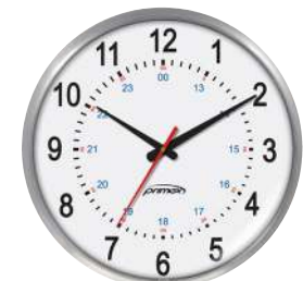
Slim Metal Health Care